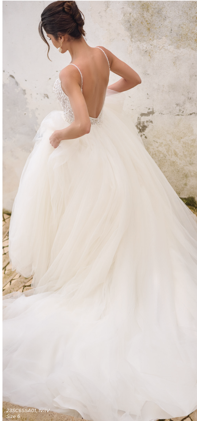
23SC655A01, IV/IV Size 6