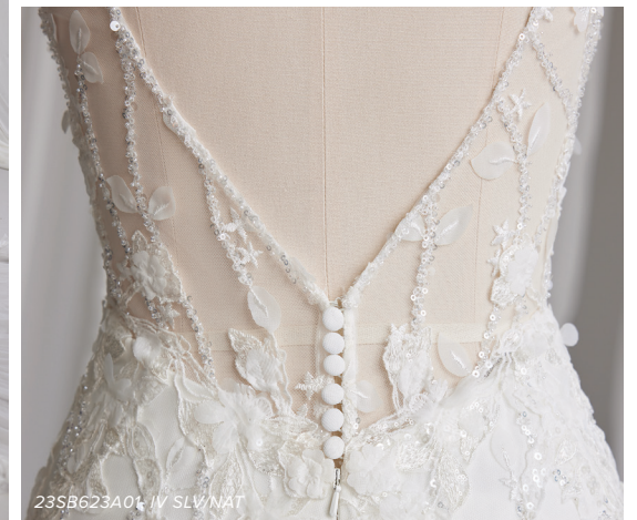
23SB623A01, IV SLV/NAT