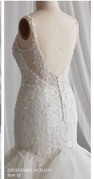
23SS635A01, IV SLV/IV Size 12