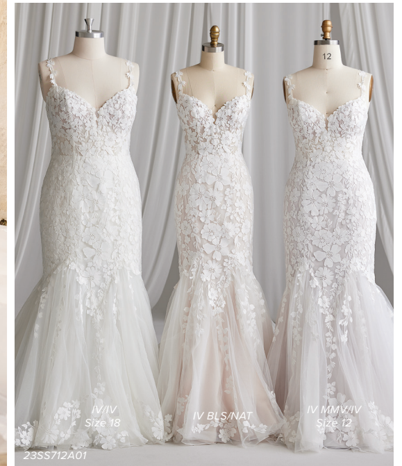
IV/IV Size 18