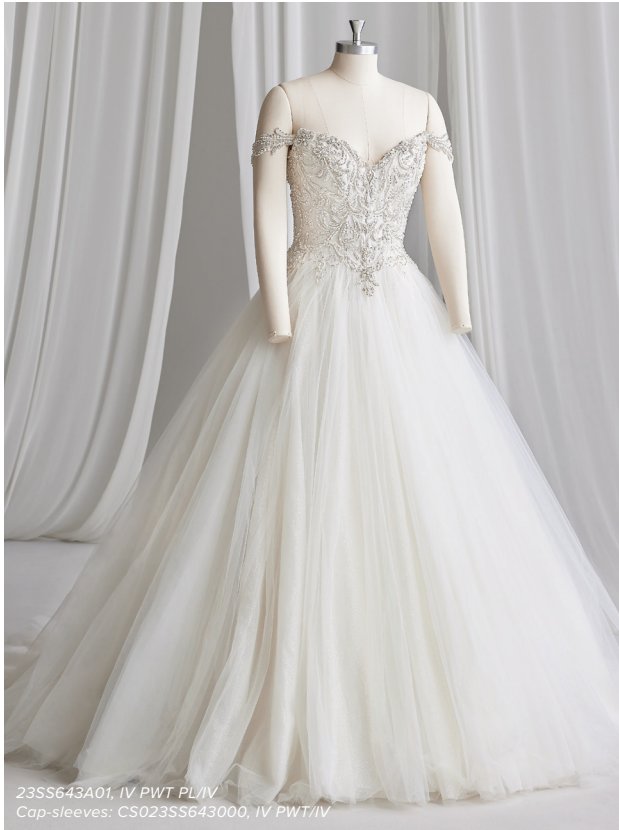
23SS643A01, IV PWT PL/IV Cap-sleeves: CS023SS643000, IV PWT/IV