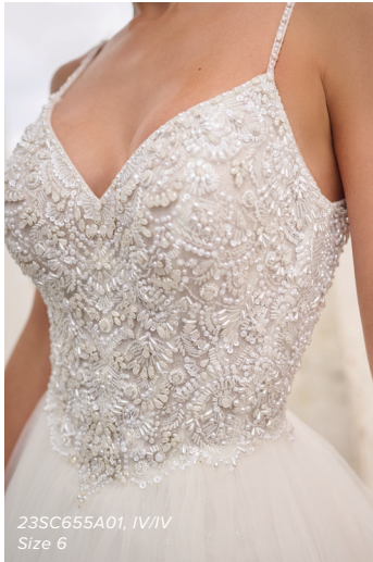
23SC655A01, IV/IV Size 6