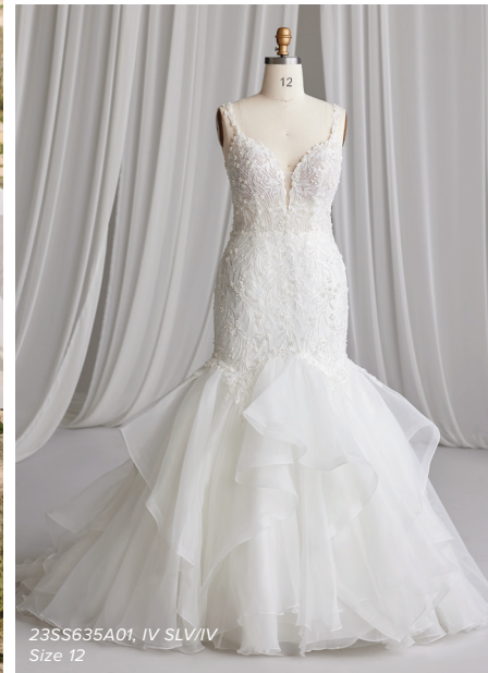
23SS635A01, IV SLV/IV Size 12