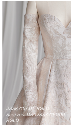
23SK715A01, RGLD Sleeves: DS023SK715000, RGLD