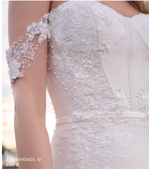
23SW640A01, IV Size 6