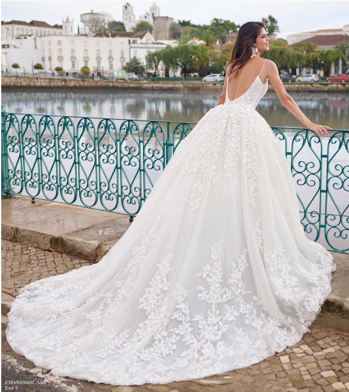
23SV609A01, IV/IV Size 6