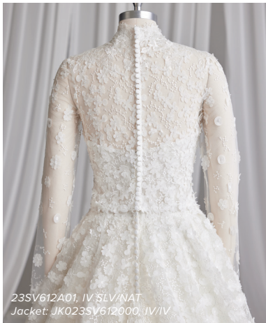
23SV612A01, IV SLV/NAT Jacket: JK023SV612000, IV/IV