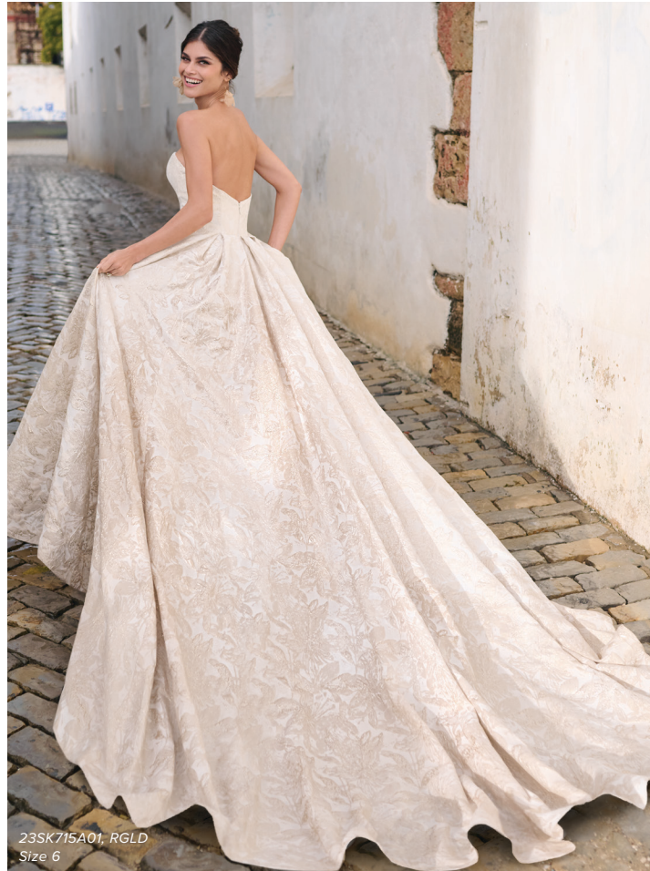
23SK715A01, RGLD Size 6