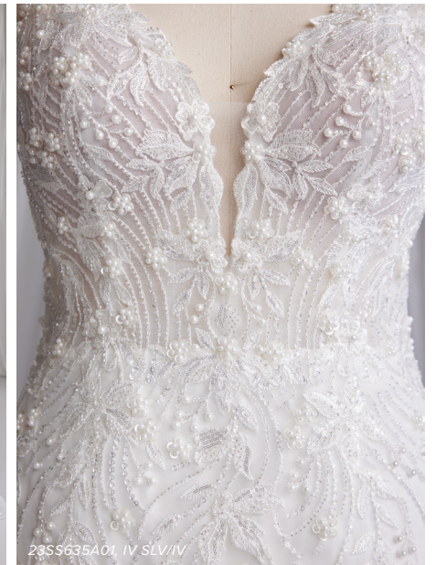
23SS635A01, IV SLV/IV