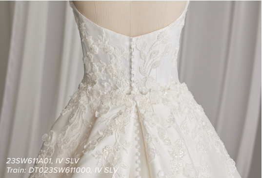
23SW611A01, IV SLV Train: DT023SW611000, IV SLV