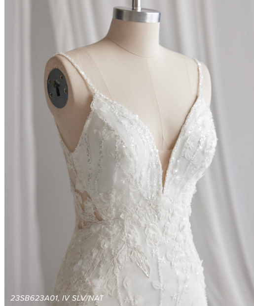
23SB623A01, IV SLV/NAT