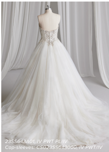
23SS643A01, IV PWT PL/IV Cap-sleeves: CS023SS643000, IV PWT/IV