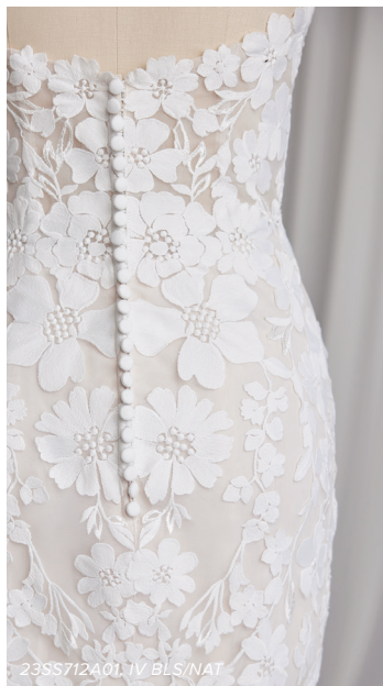
23SS712A01, IV BLS/NAT