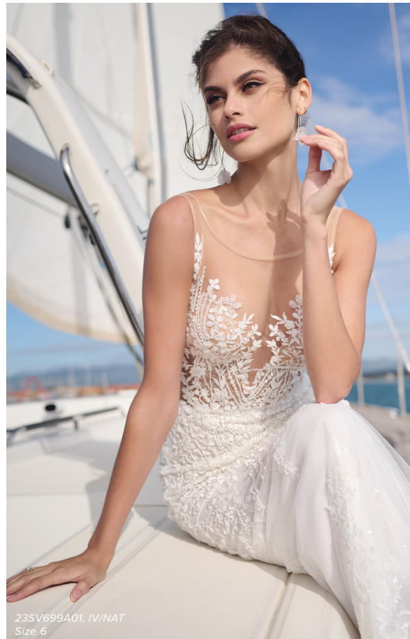
23SV699A01, IV/NAT Size 6