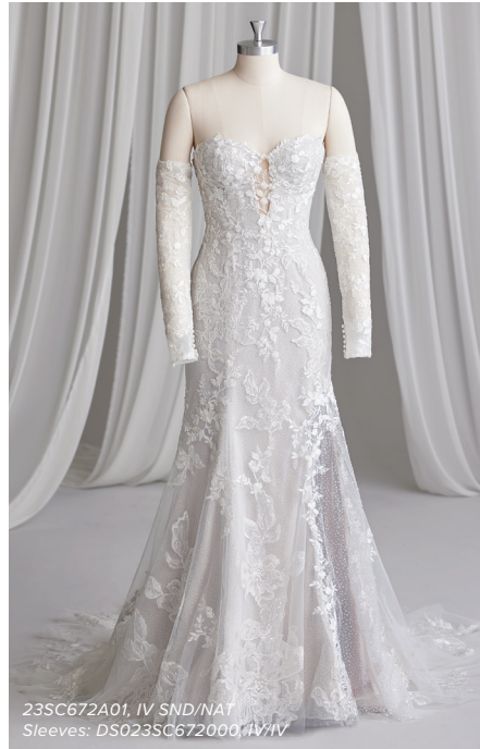
23SC672A01, IV SND/NAT Sleeves: DS023SC672000, IV/IV