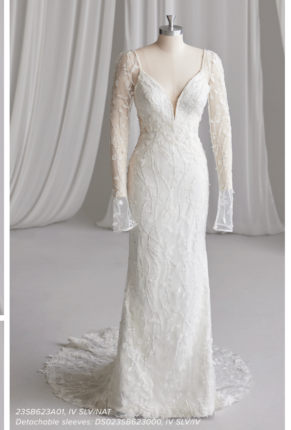
23SB623A01, IV SLV/NAT Detachable sleeves: DS023SB623000, IV SLV/IV