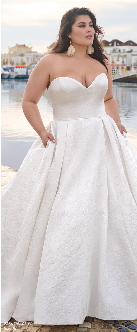
23SK715A01, IV Size 18