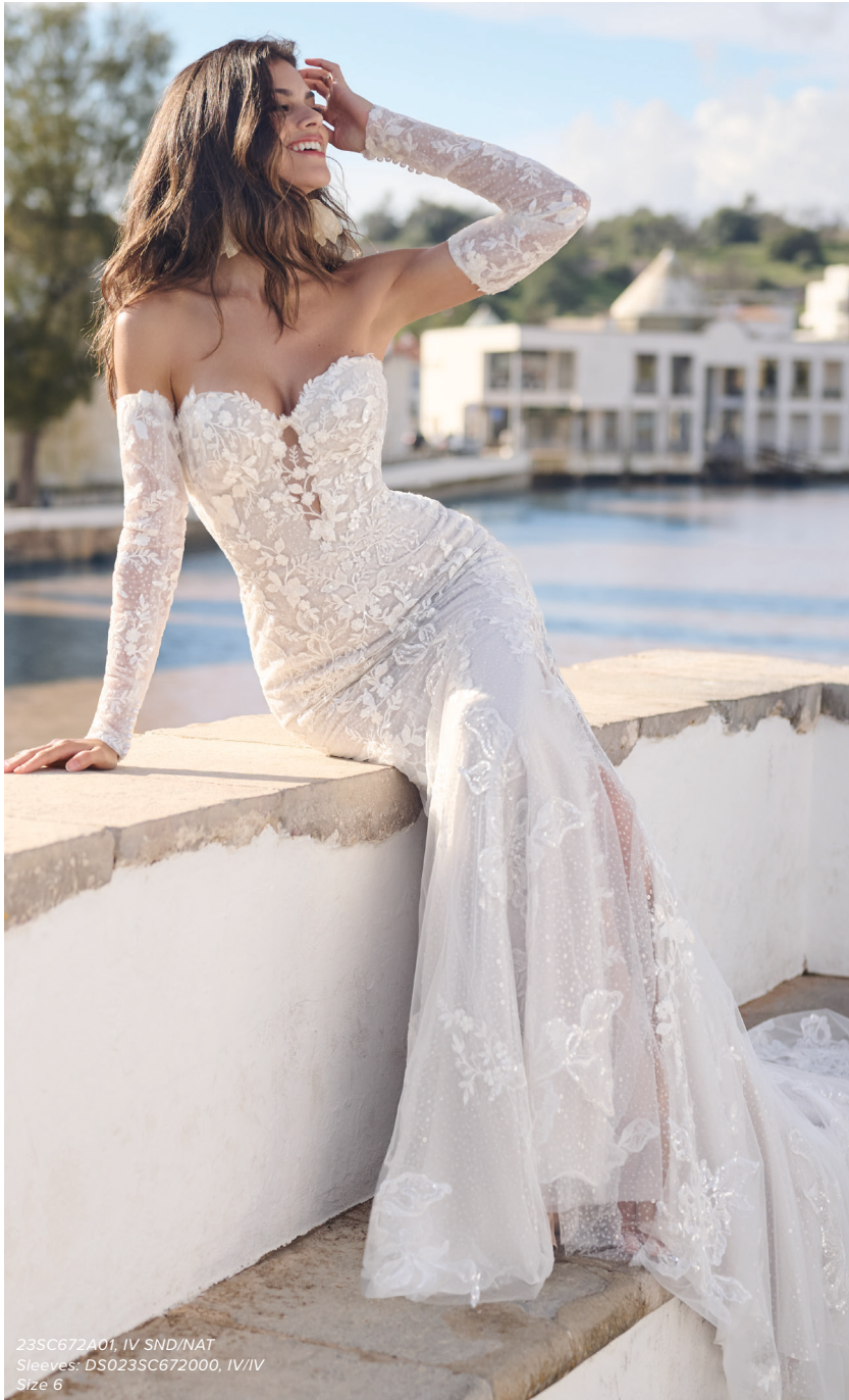
23SC672A01, IV SND/NAT Sleeves: DS023SC672000, IV/IV Size 6