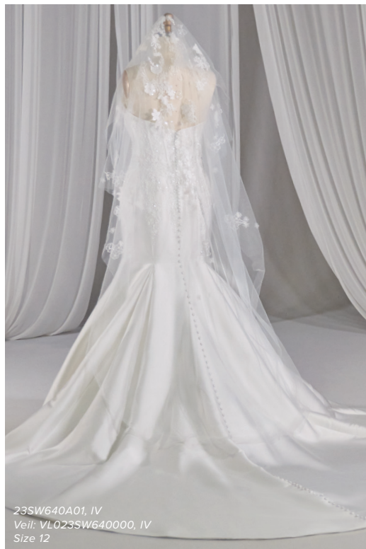
23SW640A01, IV Veil: VL023SW640000, IV Size 12