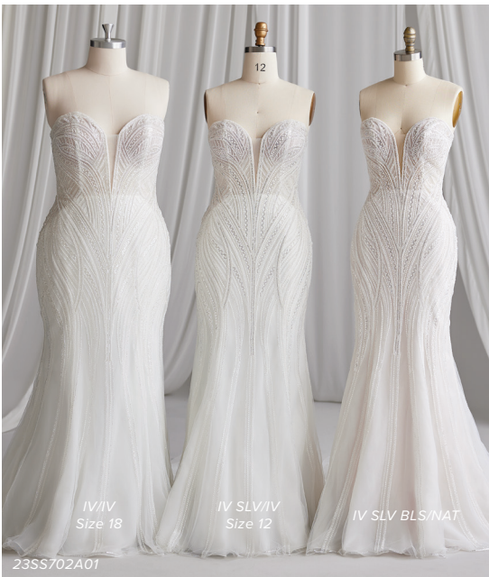
IV/IV Size 18 IV SLV/IV Size 12 IV SLV BLS/NAT 23SS702A01