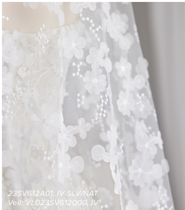
23SV612A01, IV SLV/NAT Veil: VL023SV612000, IV