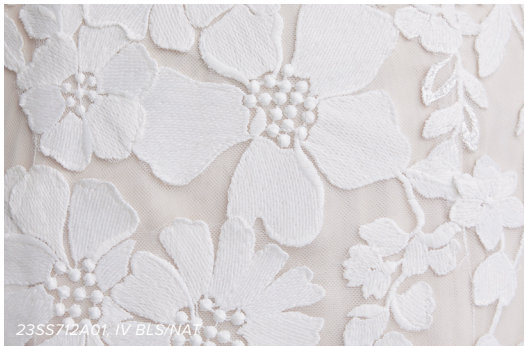
23SS712A01, IV BLS/NAT