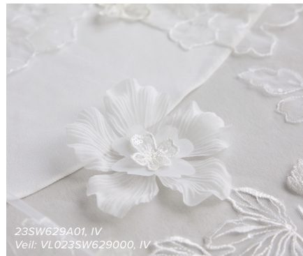
23SW629A01, IV Veil: VL023SW629000, IV