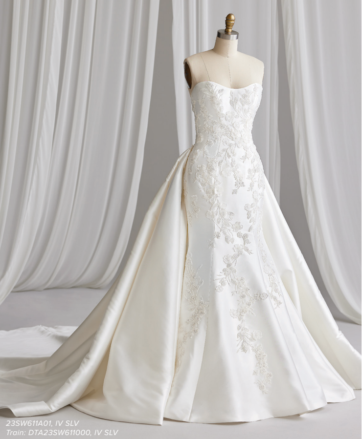
23SW611A01, IV SLV Train: DTA23SW611000, IV SLV