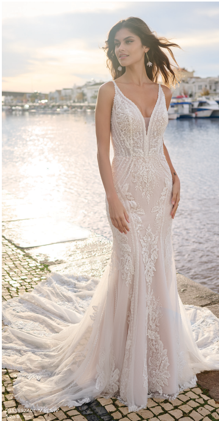
23SS692A01, IV BLS/IV Size 8