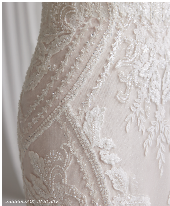
23SS692A01, IV BLS/IV