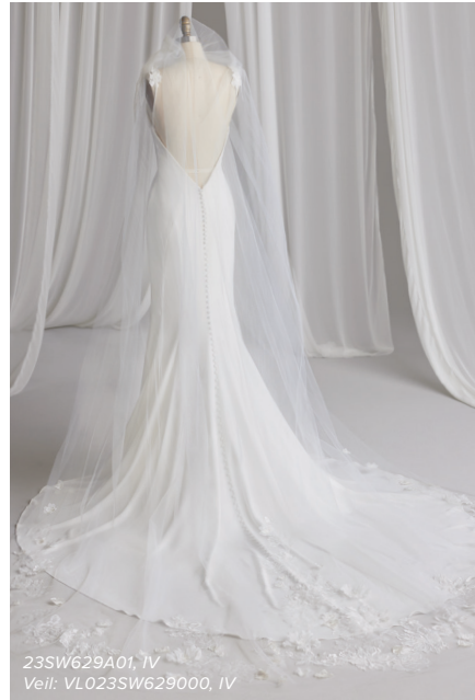
23SW629A01, IV Veil: VL023SW629000, IV