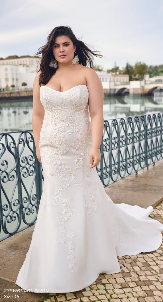
23SW611A01, IV SLV Size 18