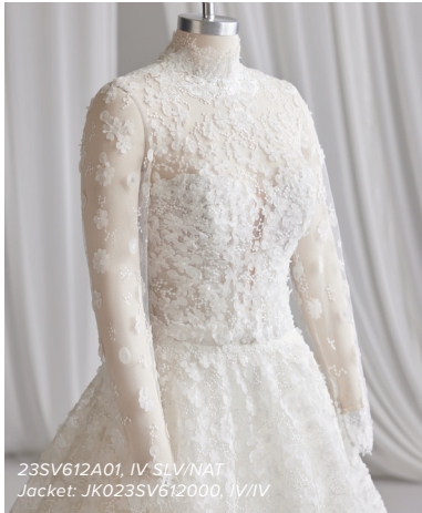
23SV612A01, IV SLV/NAT Jacket: JK023SV612000, IV/IV