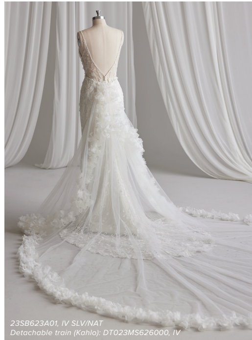
23SB623A01, IV SLV/NAT Detachable train (Kahlo): DTO23MS626000, IV