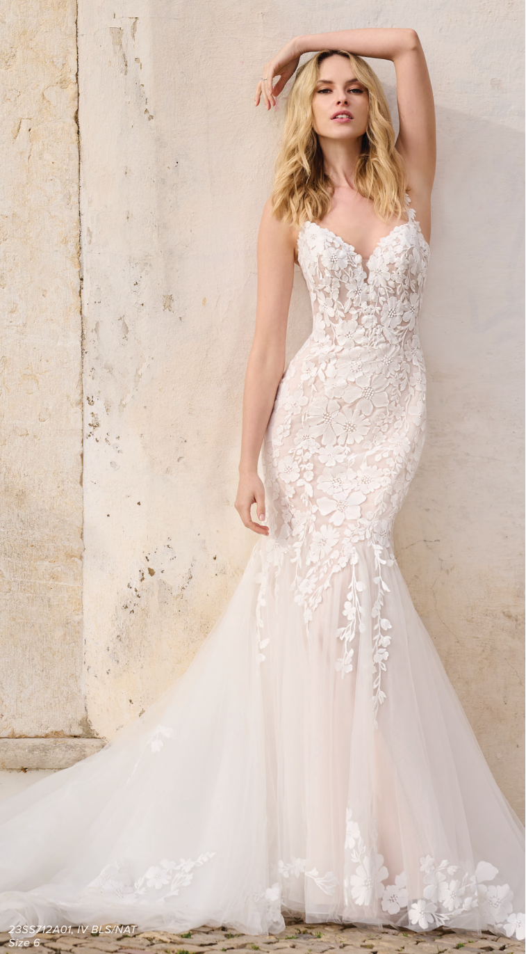
23SS712A01, IV BLS/NAT Size 6