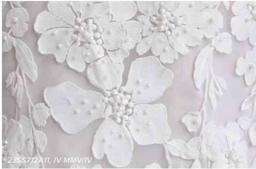
23SS712A11, IV MMV/IV