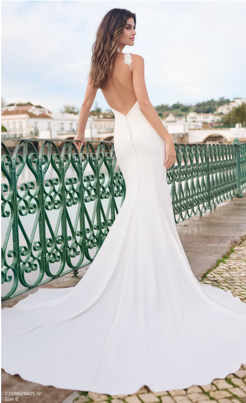
23SW629A01, IV Size 6