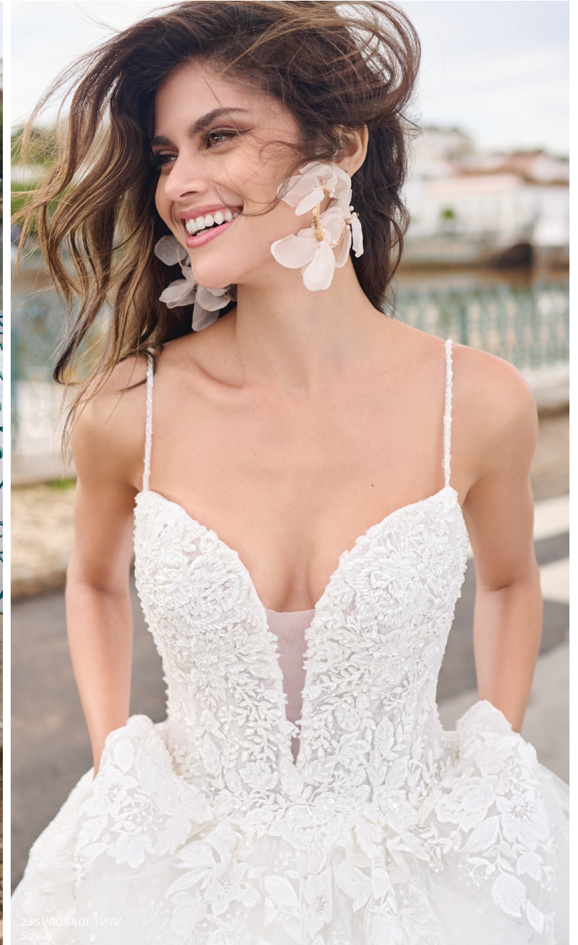
23SV609A01, IV/IV Size 8