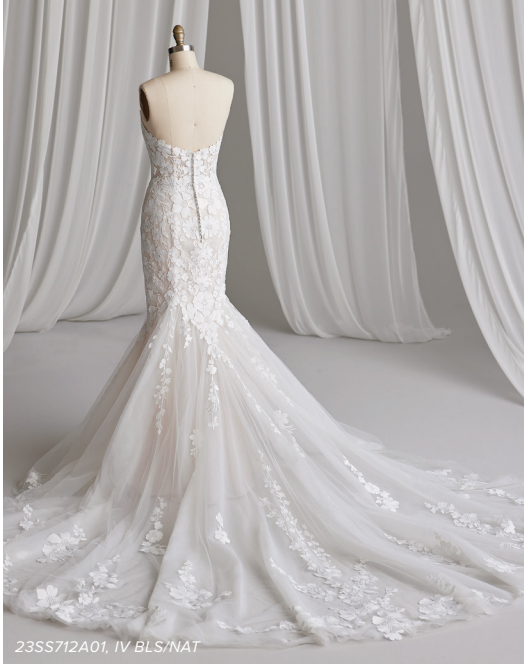
23SS712A01, IV BLS/NAT