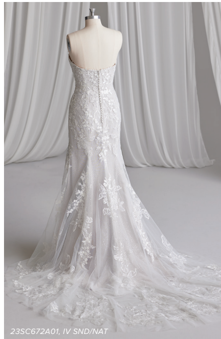
23SC672A01, IV SND/NAT