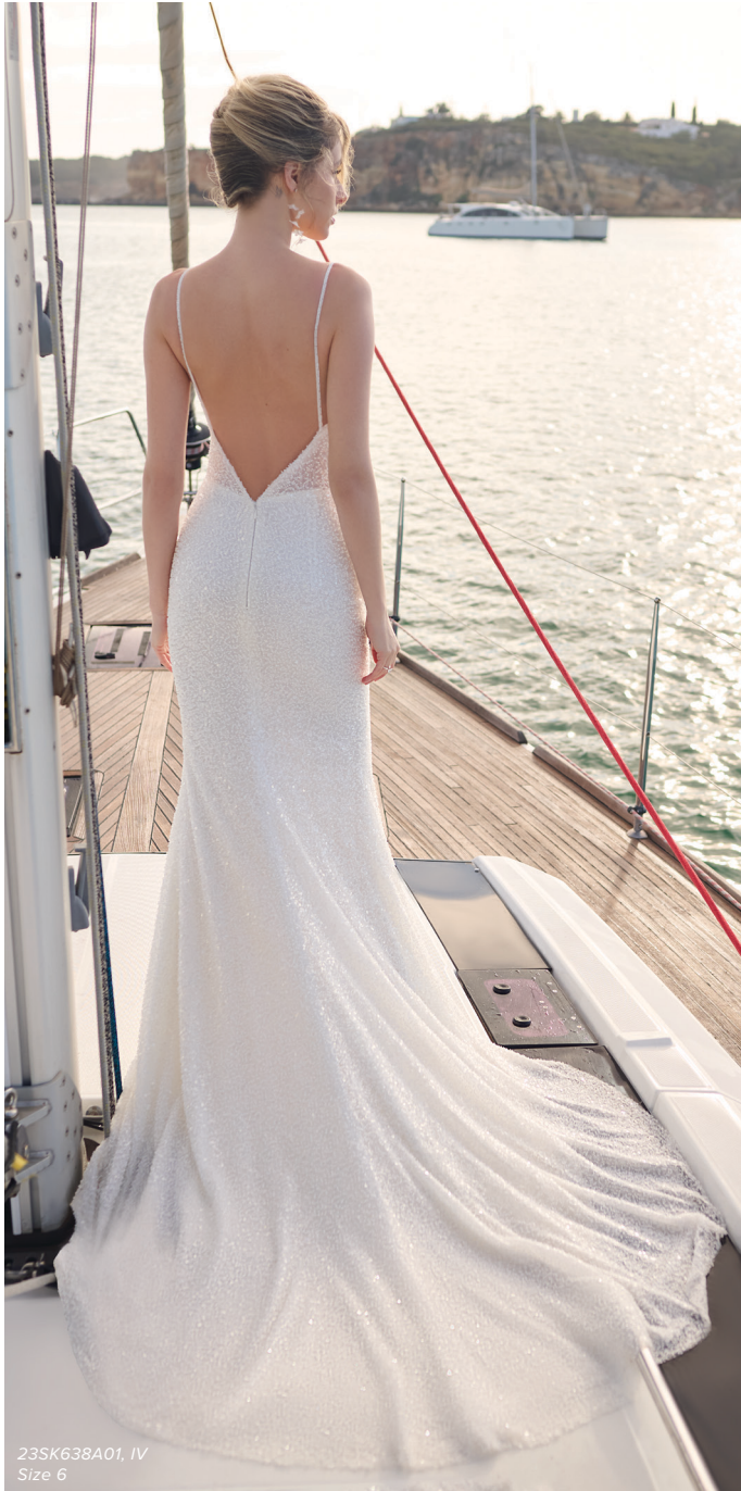
23SK638A01, IV Size 6