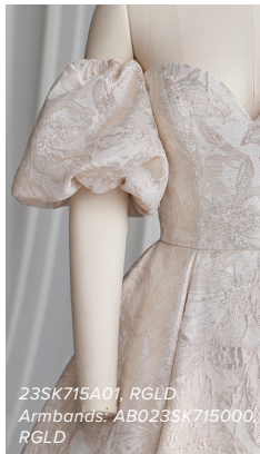
23SK715A01, RGLD Armbands: AB023SK715000, RGLD