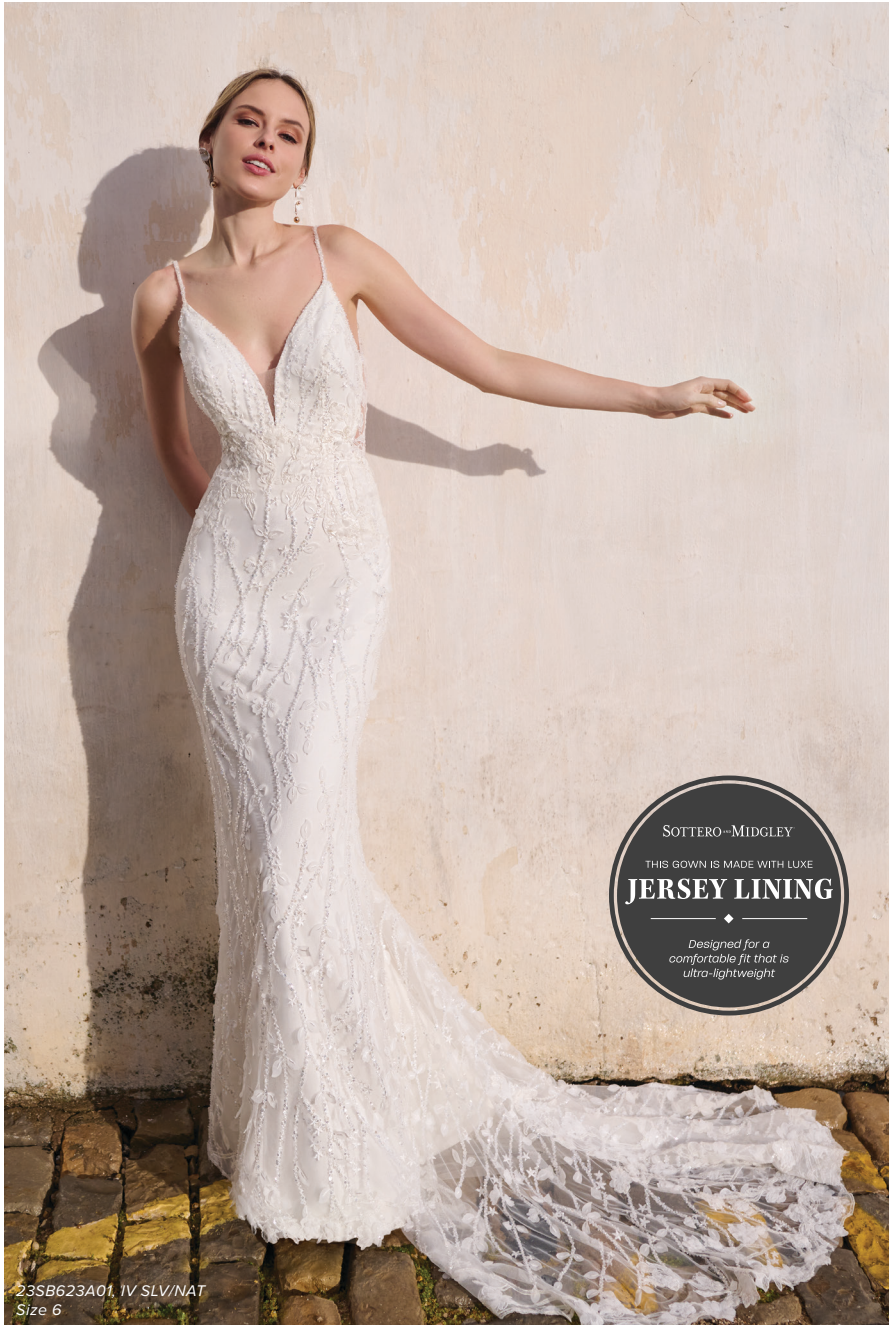
23SB623A01, IV SLV/NAT Size 6