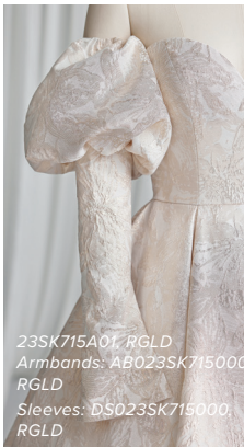
23SK715A01, RGLD Armbands: AB023SK715000, RGLD Sleeves: DS023SK715000, RGLD