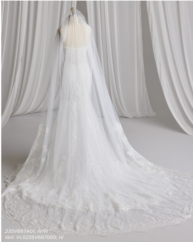
23SV667A01, IV/IV Veil: VL023SV667000, IV