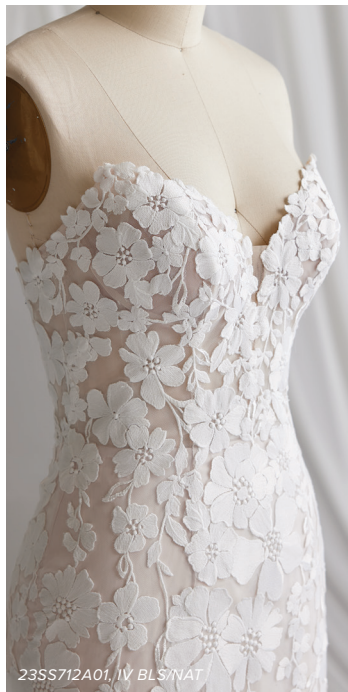
23SS712A01, IV BLS/NAT