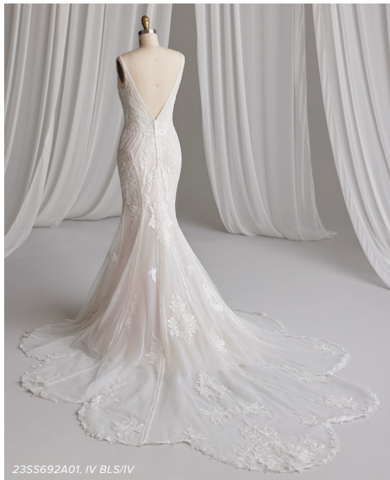
23SS692A01, IV BLS/IV