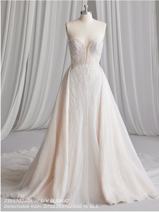
23SS702A01, IV SLV BLS/NAT Detachable train: DT023SS702000, IV BLS