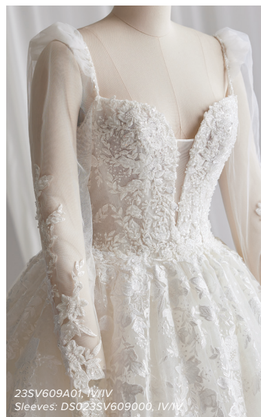
23SV609A01, IV/IV Sleeves: DS023SV609000, IV/IV