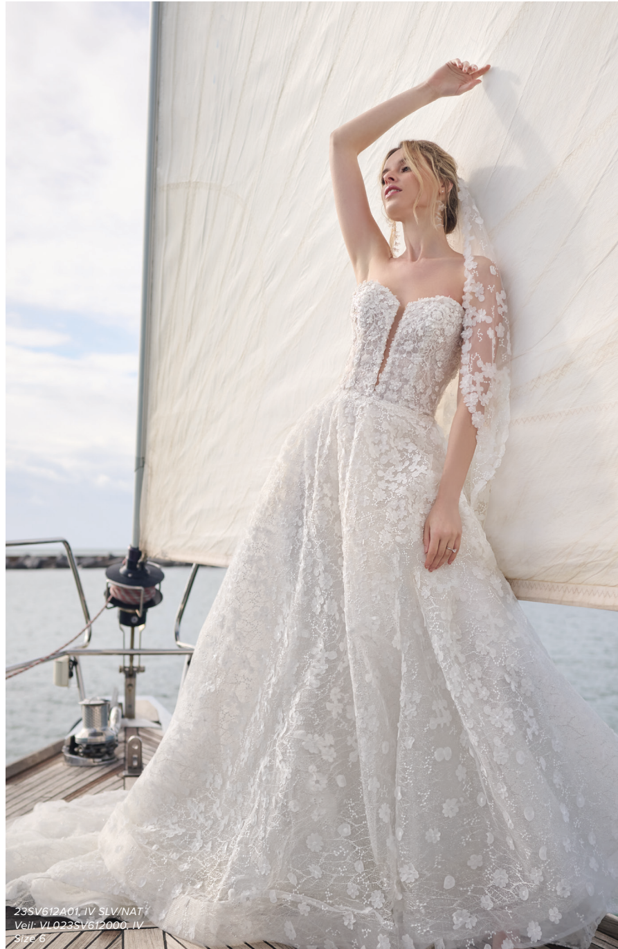
23SV612A01, IV SLV/NAT Veil: VL023SV612000, IV Size 6