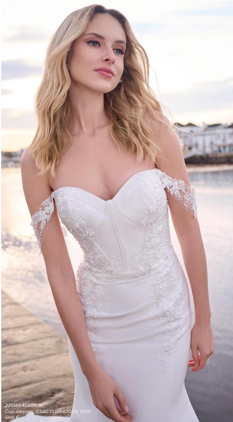
23SW640A01, IV Cap-sleeves: CS023SW640000, IV/IV Size 6