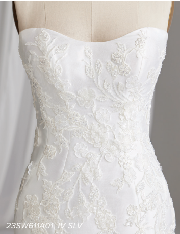
23SW611A01, IV SLV