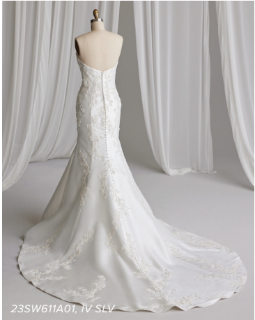
23SW611A01, IV SLV