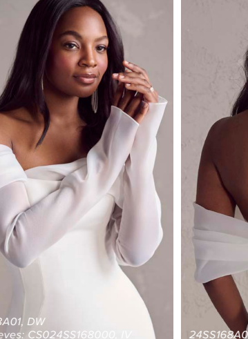
24SS168A01, DW Cap-sleeves: CS024SS168000, IV Long sleeves: DSA24SS168000, IV Size 6